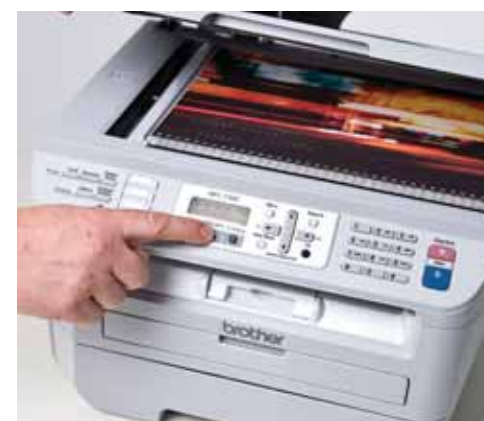
High quality colour and mono scanning.