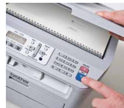
Fax, copy or scan your bound documents.