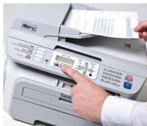
Automatic Document Feeder – ideal when faxing, copying or scanning multiple page documents.

Far more than just a printer, the MFC-7320 comes with a host of features that can benefit your business.