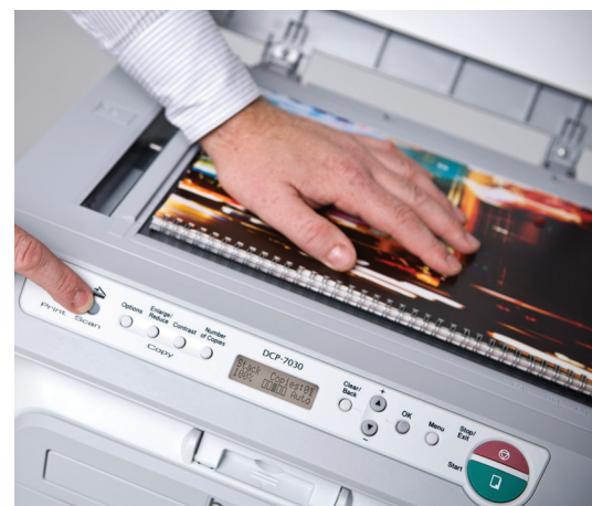
High quality colour and mono scanning.

The DCP-7030 is much more than just a printer as it comes with a range of features that can really benefit your small business.