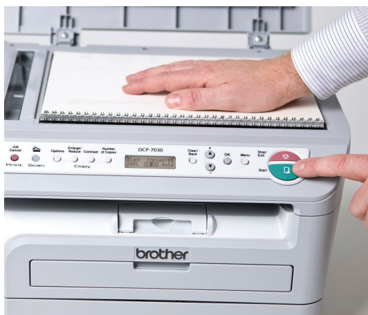
Copy or scan your bound documents.

Stack and sort: If you need to make several copies of a multi-page document, then the stack and sort feature can automatically collate the pages into the correct order, so you don't have to waste time doing it by hand.