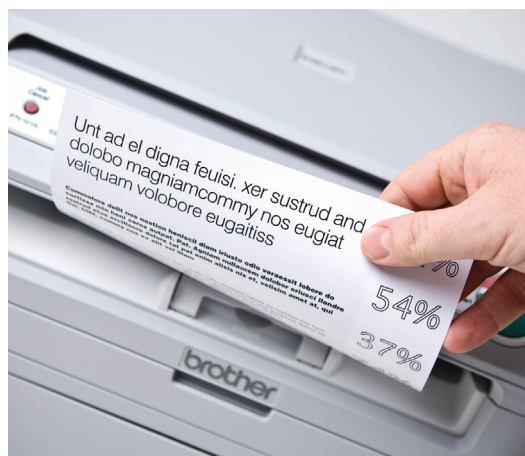
Fast, high quality mono printing.