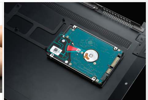
Anti-shock hard drive protection