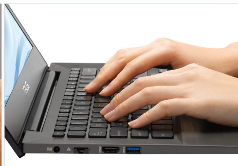
Spill-resistant, responsive true-comfort keyboard