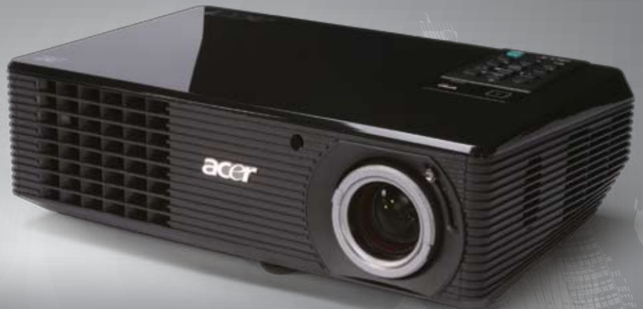
Acer X 1260P/1160PZ

For the optimum projection that's budget-friendly, look no further than the Acer Value Series projectors. Featuring 2400 ANSI Lumens brightness, 2500:1/2700:1 3 contrast ratio, Acer ColorBoost II and Acer SmartFormat technologies, and native SVGA 1 /XGA 2 resolution, this series is perfect for home entertainment, SMB or educational settings, or multi-venue settings requiring clear, crisp projection of highly detailed text and images. An environment-friendly solution, the Acer EcoProjection technology reduces standby power consumption by up to 50 percent while delivering superb performance. And the Acer ePower Management enables users to customize power-saving configurations.