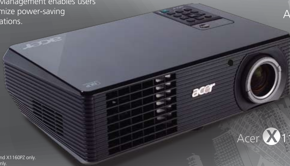
Acer X 1160P