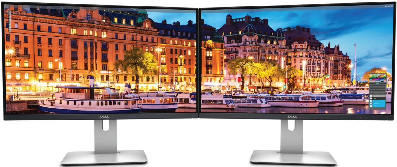
Dell UltraSharp 25 Monitor | U2515H 63.44 cm (25 inches)