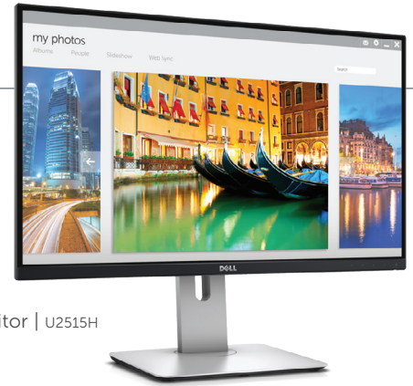
Dell UltraSharp 25 Monitor | U2515H 63.44 cm (25 inches)