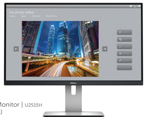
Dell UltraSharp 25 Monitor | U2515H 63.44 cm (25 inches)

For More Information visit www.dell.com/monitors